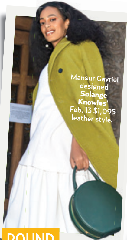
Mansur Gavriel designed Solange Knowles' Feb. 13 $1,095 leather style.