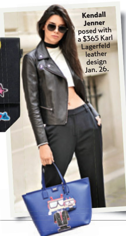
Kendall Jenner posed with a $365 Karl Lagerfeld leather design Jan. 26.

BAG Faux-leather 6x8x2-inch satchel with removable straps, $40, zara.com CHARM Juicy Couture 2 1/2 x 6 1/2-inch gold-tone star bauble with clasp closure, $26, kohls.com